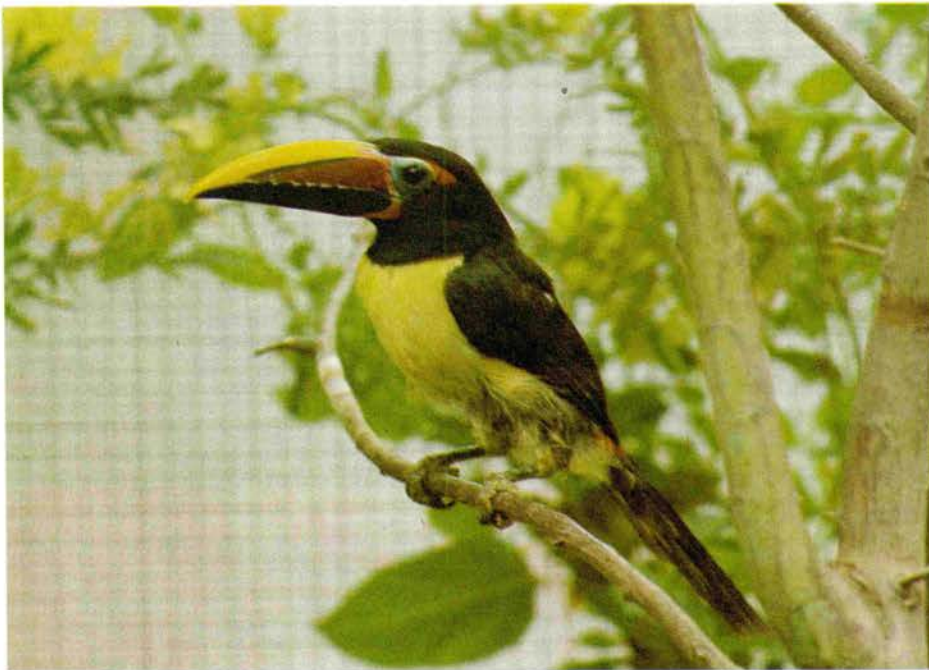
Adult male green aracari ( Pteroglossus viridis )