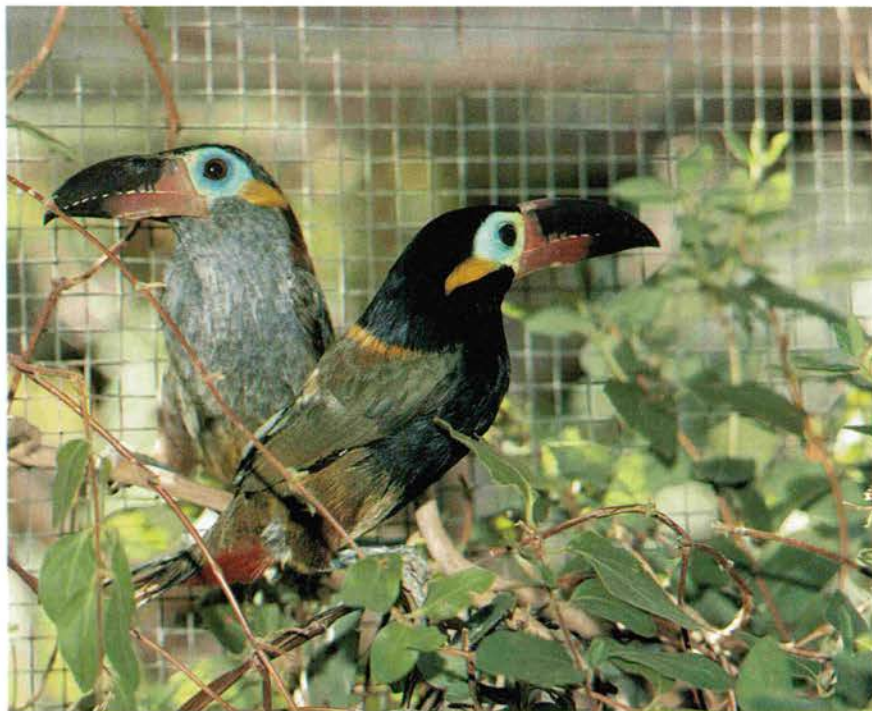
A breeding pair of Guyana Toucanets at the author's Emerald Forest Bird Gardens, Fallbrook, CA.