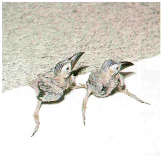
Young Guyana Toucanets at age of four weeks.